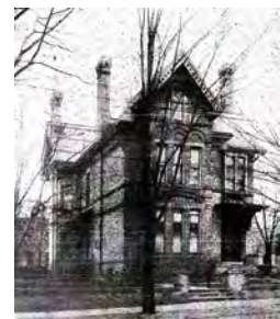
Women's Social Officer's Training College

Write to the Candidate's Secretary, Toronto