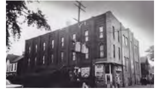
Lippincott St. Building 1888

In a publication dated 1890 we read the following: “This is a sketch of our Training Home at Lippincott street Toronto for females. We have Training operations going ahead at Ottawa, St. John N.B, Vancouver and Toronto which give a proper systematical qualification for the many duties to contend with when a person enters the field as an officer.