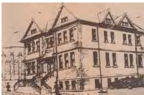
Springdale St. St. John’s