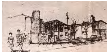
Adams Avenue St. John’s