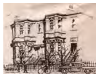
LaMarchant Rd. St. John’s