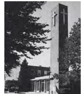
2130 Bayview Avenue 1962

The training of candidates for Salvation Army officership has seen a radical evolution from the early days of training which consisted of a few weeks training at a corps, under a senior officer to the more formal regimented and disciplined ‘live in’ ten month training sessions which were instituted in the early 1900’s. A further evolution took place with the commencement of the two year sessions in 1962 at the new College For Officer Training at 2130 Bayview Avenue. In 1999 the Territorial Commander for the UK announced a bold new venture in the training of cadets at Denmark Hill, “Tailor Made Training” he stated. The Canada Bermuda Territory soon followed suit. With the closing of the training college facilities in St. John’s, Toronto and the Toronto satellite campus in Montreal and the consolidation of training at the new Winnipeg CFOT campus, the new training program was further developed.