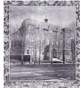
Sherbourne Street 1903

We have had 576 applications to become officers since 1899, out of this number we have accepted 279 and have postponed some 150 cases and 72 in Homes and the remainder have been rejected on the ground of inability or on record of the Medical examiner. Out of the number we have sent out as Field Officers 126 and others are now ready for commissioning. This is encouraging but we are now setting our determination on 400 candidates during the winter months. This we feel confident of achieving.”