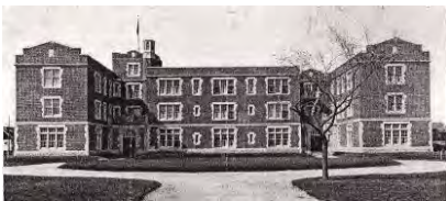
Canada West Training College 1916