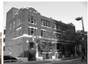
CFOT Winnipeg 2004