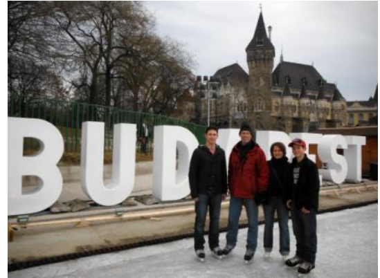
The Morgan Family in Budapest