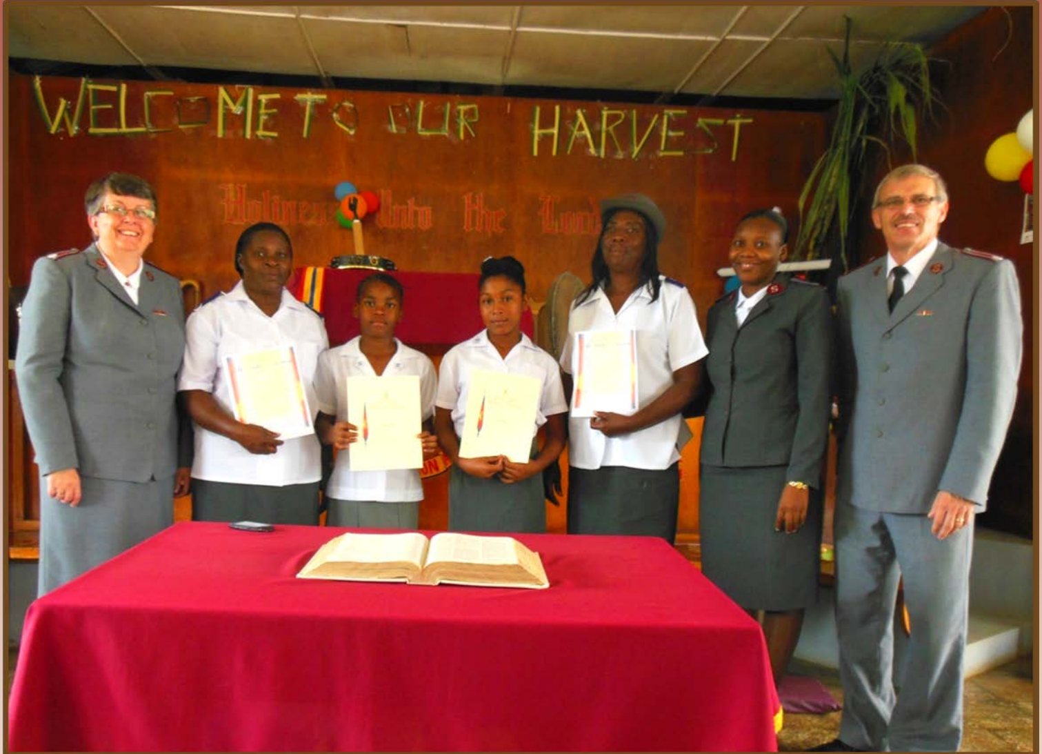
Senior and Junior Soldier enrollment