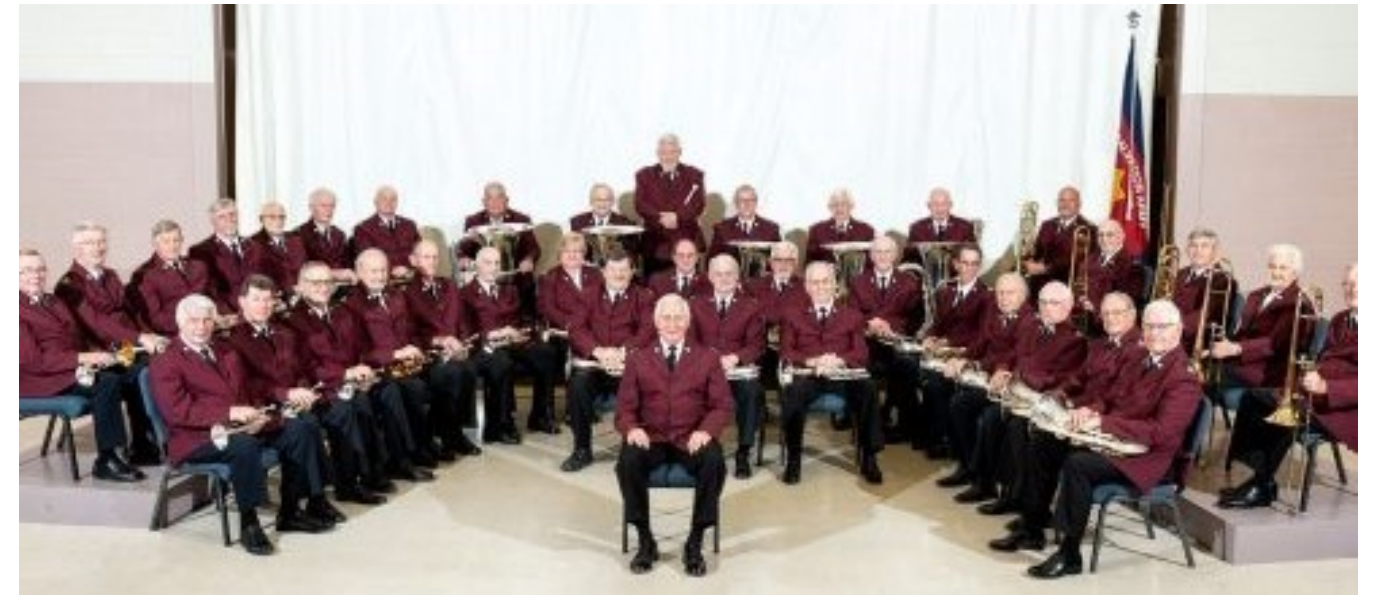
Heritage Brass — Ontario Central Division October 2018