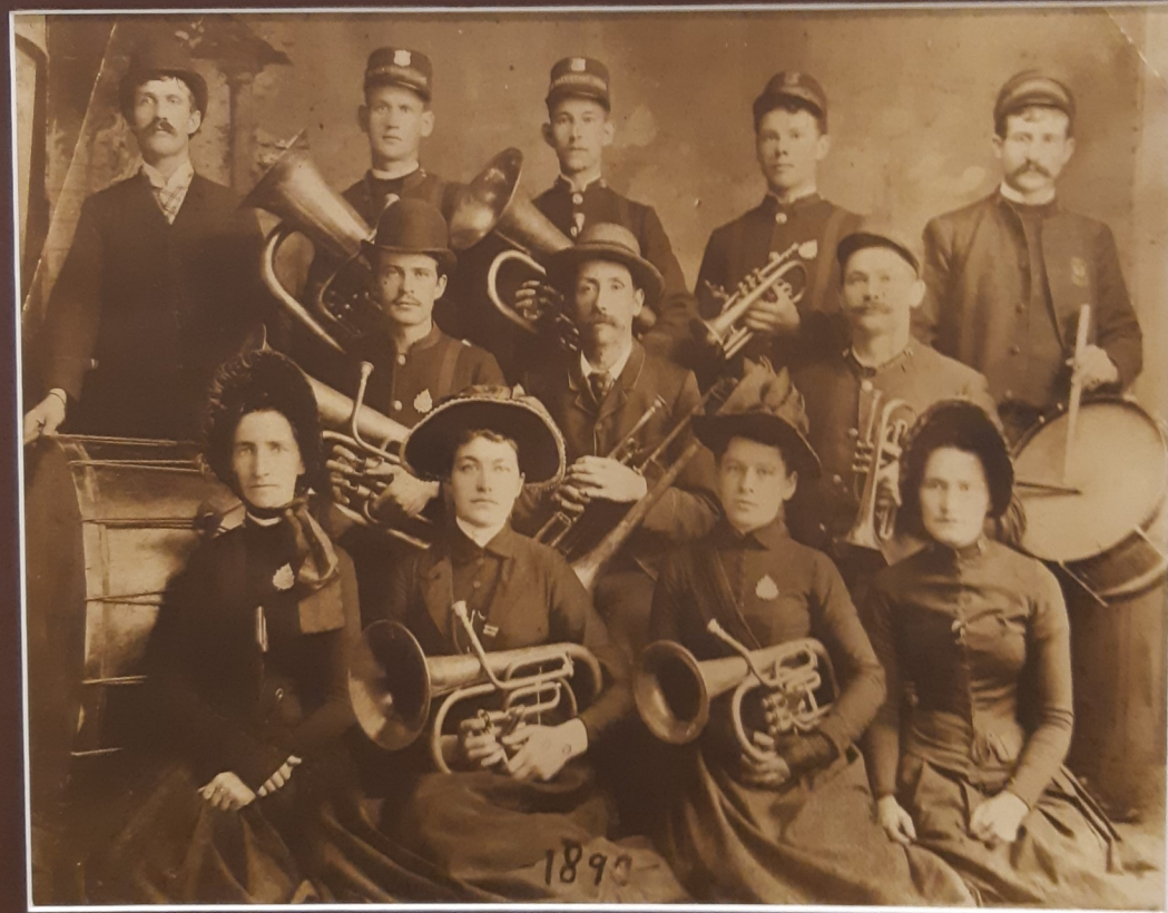
Lisgar Street Corps Band — Toronto — 1893

From the very beginning, banding has been and still is an integral expression of Army worship and outreach. As Army corps sprung up in communities all over the Canada and Bermuda Territory, Salvationists formed all kinds of music combinations — especially brass bands. These groups practiced hard, played enthusiastically, and grew in skill and numbers significantly.