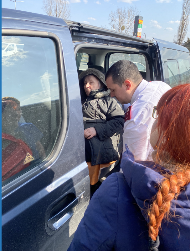
trip transporting Ukrainian Family from Moldovan_Ukrainian Border to Romania