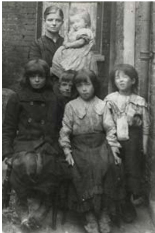
Ready to Serve, ©The Salvation Army – Canada and Bermuda Territory. Permission to photocopy this handout granted for local use only.