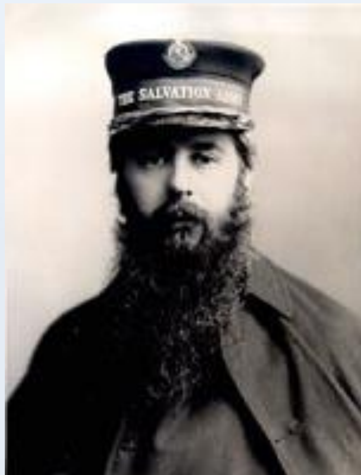
Bramwell Booth, Chief of the Staff

What were the men of The Salvation Army leadership hearing from their wives on Child Prostitution?