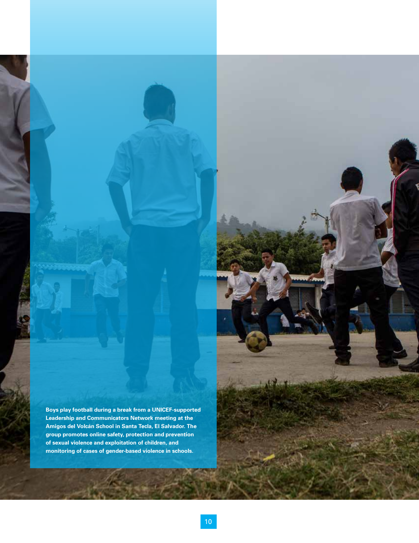
Boys play football during a break from a UNICEF-supported Leadership and Communicators Network meeting at the Amigos del Volcán School in Santa Tecla, El Salvador. The group promotes online safety, protection and prevention of sexual violence and exploitation of children, and monitoring of cases of gender-based violence in schools.