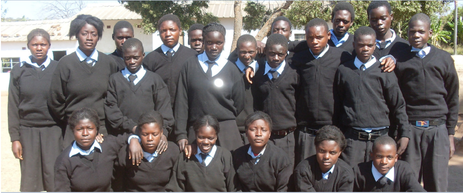
Students receive an opportunity to build skills and knowledge for a brighter future.

E ducation is key to a brighter future. In Zambia, children are being assisted with fees and supplies in nine regions. In this central African nation, the government estimates that there will be over one million orphans by 2015. These orphans, the poorest and most vulnerable of children, come into the care of other relatives with their own children, or grandparents, who themselves are part of the vulnerable population. Often orphans do not get a chance to be educated. Families often only have enough money to pay fees for their own children to attend school, therefore the orphans are unable to attend school. These impoverished children are assisted with their education through Salvation Army elementary and secondary schools.