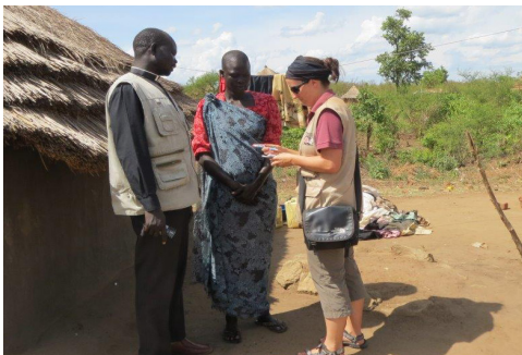
A beneficiary of a Salvation Army shelter in South Sudan.

If you would like to donate to either of these response efforts please visit www.salvationarmy.ca or contact us at 416-422-6224.