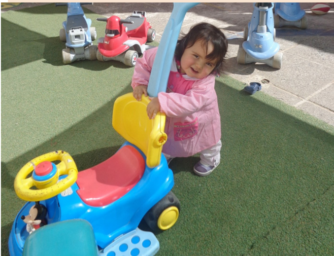
Little girl (bottom) poses with her new favorite toy while playing outside at the Faro des Angelos Nursery and Daycare Centre located in Chile

"The result is improved nutrition levels, better school results and a brighter future for the children and youth"