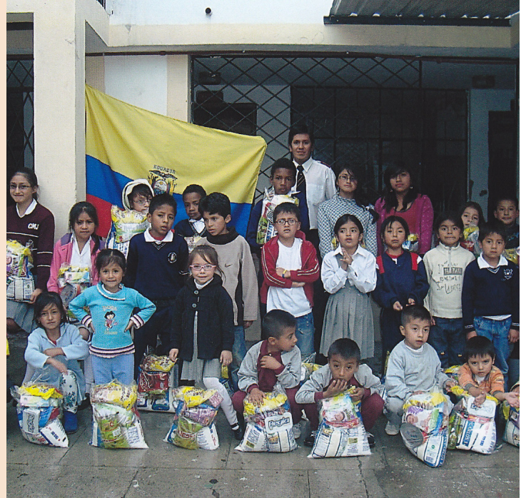
Students (top) at Flor de Bastion in Ecuador pose with groceries received through Brighter Futures Children's Sponsorship

Yes, a child can walk courageously and confidently into the future with the good early education and nutritional assistance given to them through The Salvation Army's Brighter Futures Children's Sponsorship.