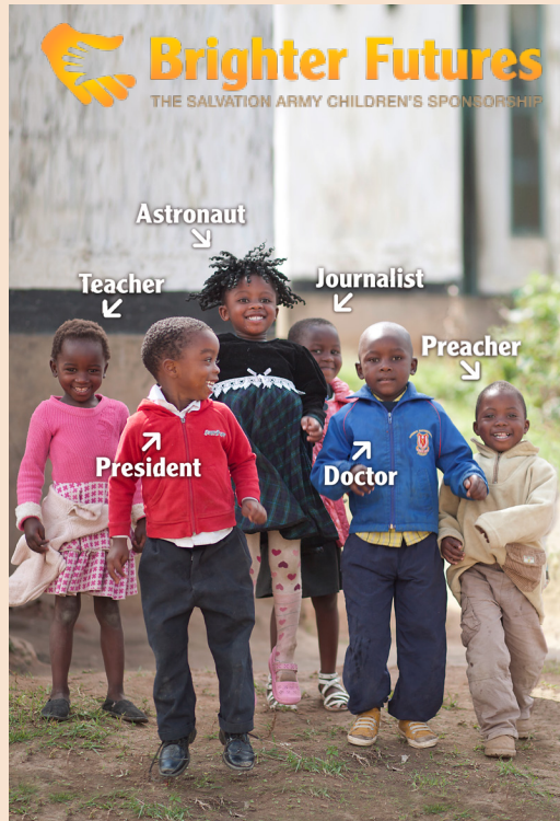
Brighter Futures The Salvation Army Children's Sponsorship is about helping children reach their full potential

Children in Indonesia, South Pacific & East Asia Zone.