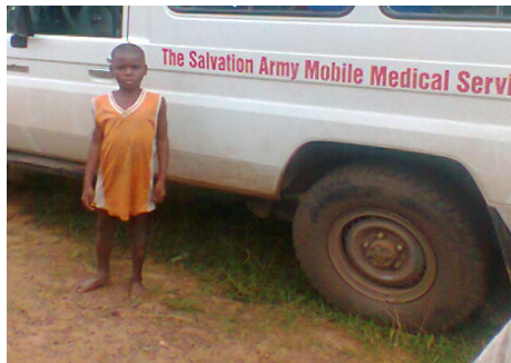
A child in Liberia stands with The Salvation Army mobile medical clinic