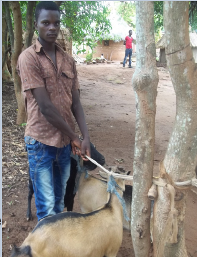
With these goats, this man will be able to provide milk, meat and income for the orphaned children that his family is raising.

The children and their guardians are very grateful for the generous support from the people in Canada and Bermuda, who faithfully assist them to find hope and a brighter future in a place where illiteracy generates poverty.