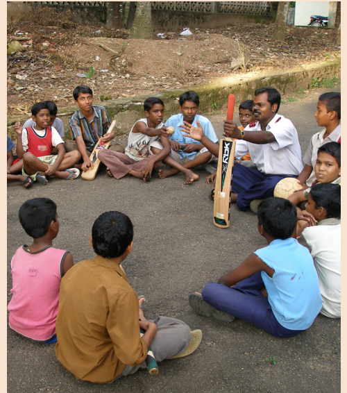
Children in Mavelikkara learn how to play cricket.

I n India South-Western, 185 children are receiving assistance through Brighter Futures Children's Sponsorship. Orphans and impoverished children are sheltered, educated and cared for in nine children's homes.