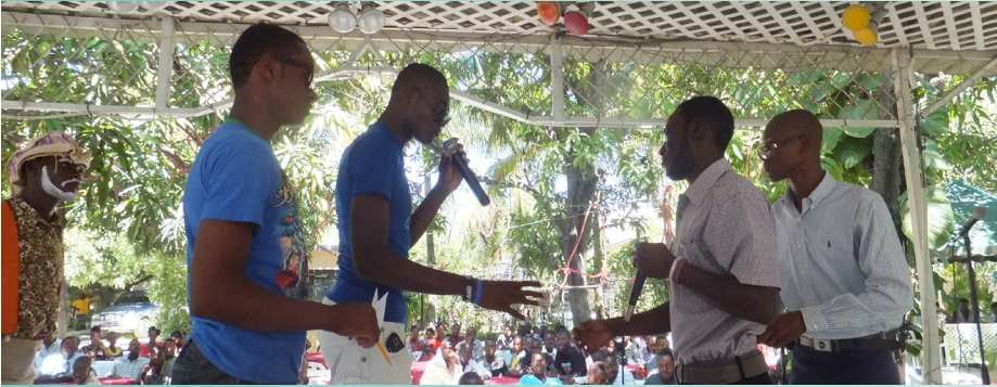
↑ A group of students perform a skit during the enrollment ceremony.