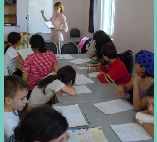
↑ Students receive extra help after school

Tucked between Turkey and Russia, the Republic of Georgia emerged from Russian rule in 1991. It has struggled through civil war and economic collapse, and is striving to thrive once again.