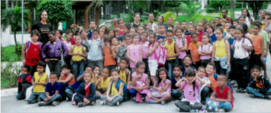
↑ Students of Vila dos Pescadores Community Programme enjoy an educational field trip.

There is a beacon of hope and health in the “Valley of Death” 12 km from the Atlantic coast of Brazil. The city of Cubatao is considered one of the 10 most polluted cities of the world; there is much industry and terrible poverty in the whole valley. When The Salvation Army started an Outpost Sunday School, parents pleaded for social protection and educational assistance for their children and teens.