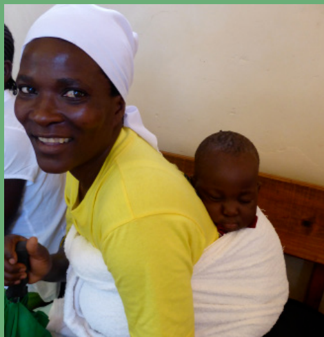
↑ A healthy baby waiting for his regular checkup at Howard Hospital. ← Mothers to be gather in one of the common areas of accomodation at Tshelanyemba.