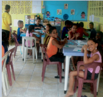
↑ Students enjoy a small break from their studies to say thank you to donors.

As youth that go through programs at our Community Centre find jobs, finish High School, and even go on to University, we rejoice that there is such a place of light, hope and health in what is known as “Valley of Death”.