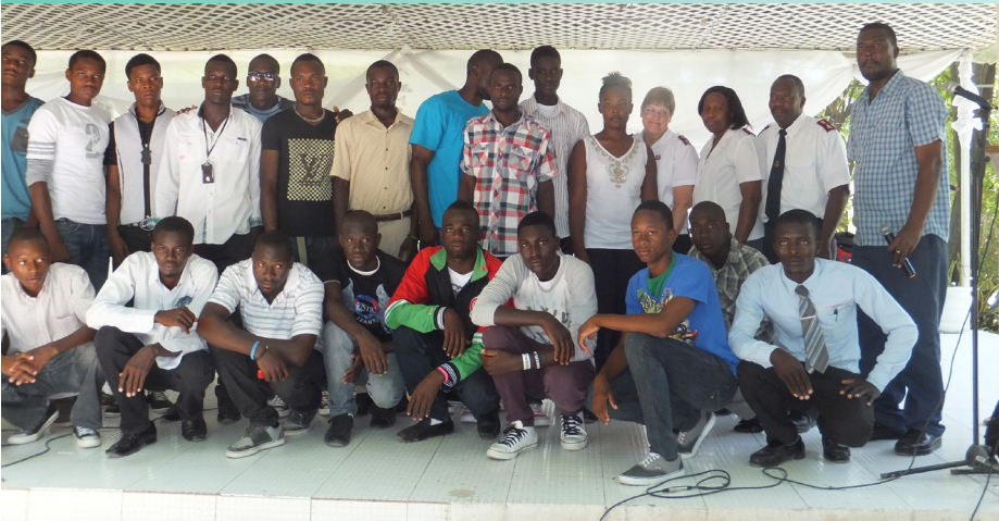
↓ Newly enrolled students at the Vocational Training Institute.

For the individuals in these photos, life is about to change. Confidence and optimism now run through their blood. Recently enrolled in the Vocational Training Institute in Haiti, the reality of education leading to employment is an exciting step to these promising students. Representatives of The Salvation Army World Missions Department were there in April participating in the enrollment ceremony, where 180 students will begin their specific trade training.