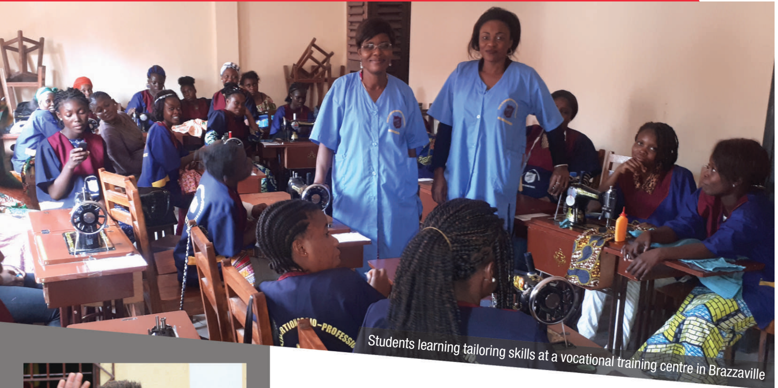
Students learning tailoring skills at a vocational training centre in Brazzaville