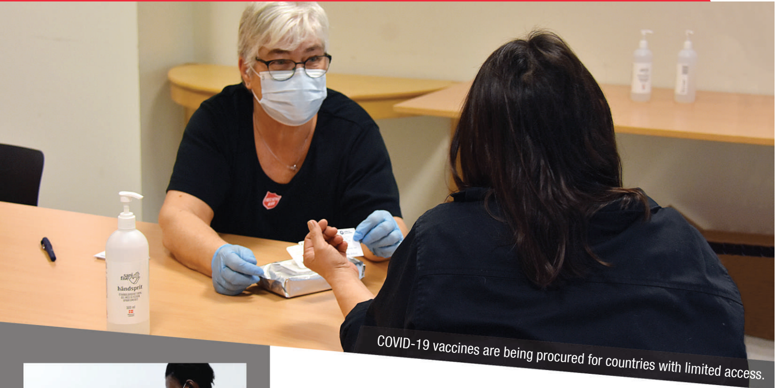
COVID-19 vaccines are being procured for countries with limited access.