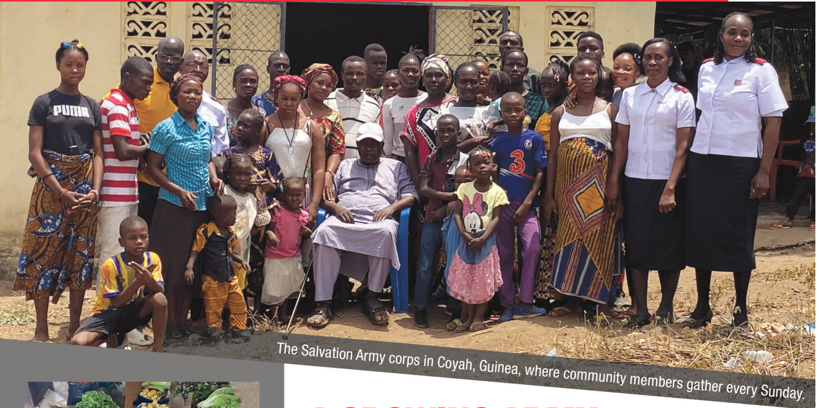
The Salvation Army corps in Coyah, Guinea, where community members gather every Sunday.