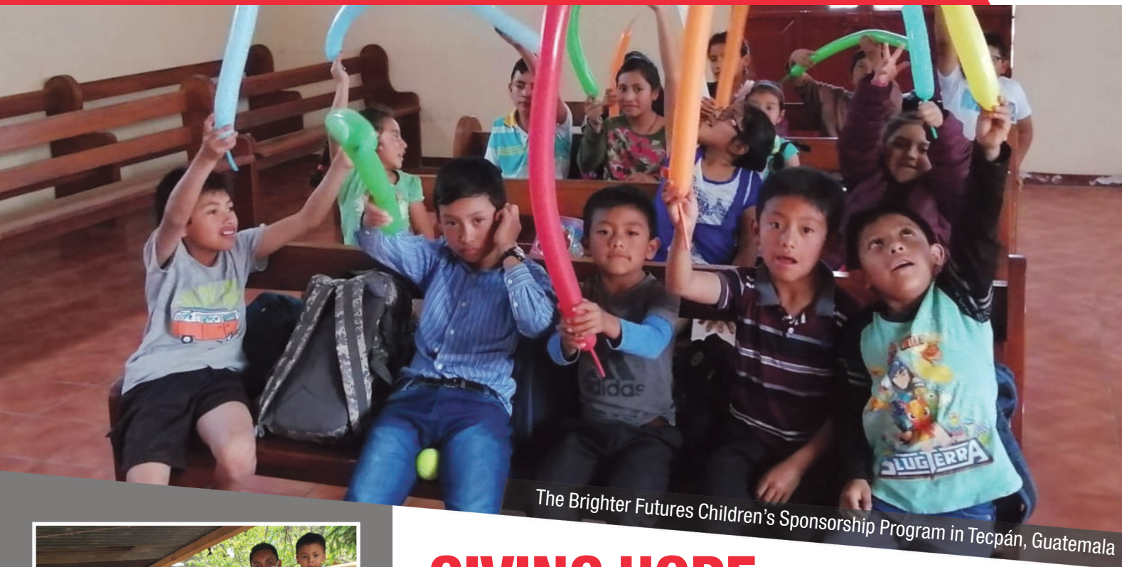
The Brighter Futures Children's Sponsorship Program in Tecpán, Guatemala