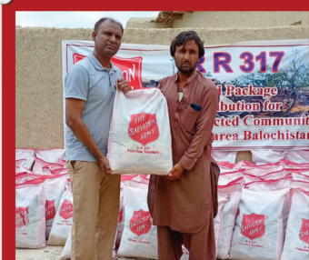
Hope Through Communities

Are you unsure about where to direct your donation?