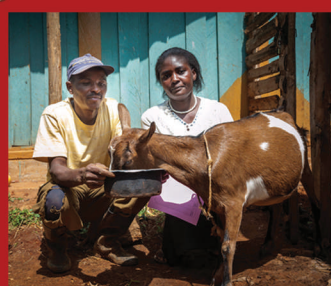
Hope Through Farming