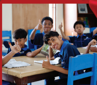
Hope Through Education