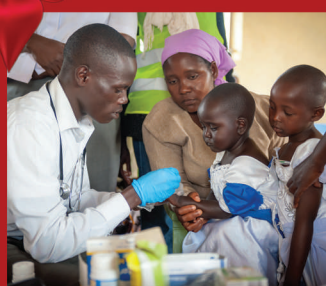
Hope Through Health