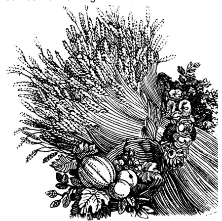
October: It's harvest time. May we be willing to witness to our faith that the harvest of souls we pray for will become a reality.

September: School bells ring in September calling students to return to the halls of learning. Let us make it our sincere prayer that we will be endued with the wisdom that comes from on high.