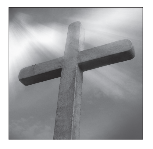
Psalm 51:7 Psalm 51:9 Isaiah 38: 17b

Luke 15:18-20 Exodus 34:6b-7a Psalm 32:5 Psalm 51:1-2